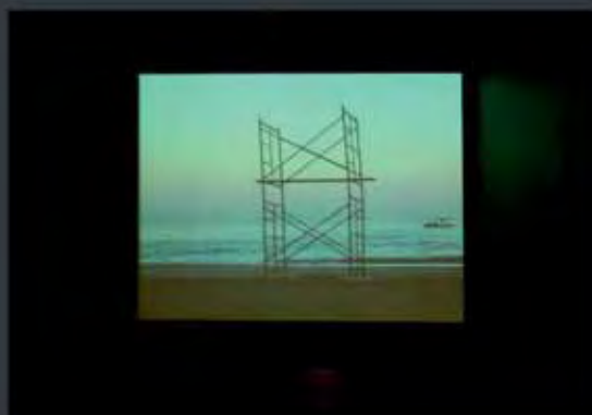
Between Earth & Sky: MX, V, 2005-07, videoinstallation.

10. kiva / temple / pyramid 1975 videoinstallation