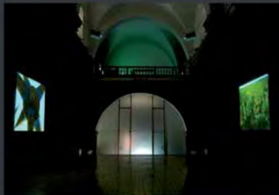
Overview of the Nave Principal.