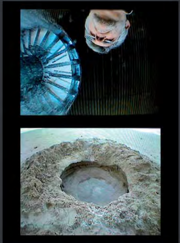
Between Earth & Sky: MX, VII, 2005-2007, Video installation.